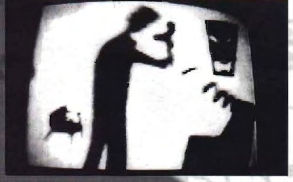
Don from Lakewood